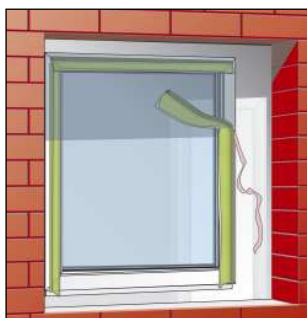
Fig. 1 Fix TP601 Compriband e onto the window frame using the self-adhesive backing

Safety data sheet must be read and understood before use.