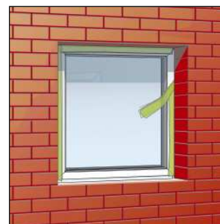
Fig. 2 Activate the expansion of TP601 Compriband e by removing the film and thread